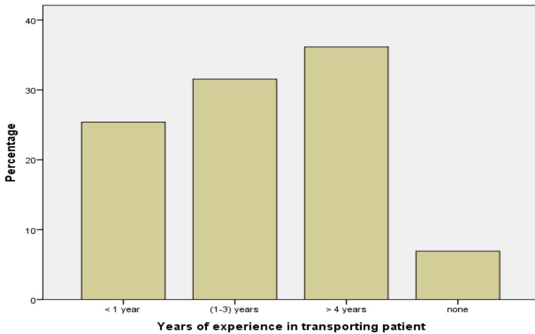
Figure 3: Escorting personnel's experience in escorting patients to EMD-MNH