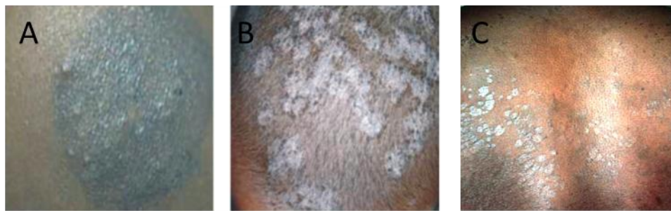
Fig. 1. A: Body ringworm on the upper arm (tinea corporis); B: Ring worm of the scalp (tinea capitis) on human head, and C: Tinea versicolor due to invasion of cornified skin on upper back by Malassezia species

Also, a positive correlation between bodyweights and recurrence frequency of CMs (R= 0.139; p = .02). ANOVA showed that diagnosis of other types of skin infections was an indicative of CMs (p < .01). Seasonal weather changes were attributed to the recurrence of CM (x 2 = 7.023, p = 0.03). Most respondents (85.3%; n = 168) reported to had contracted CMs during the hot-summer season than the rest of the year (Fig. 2).