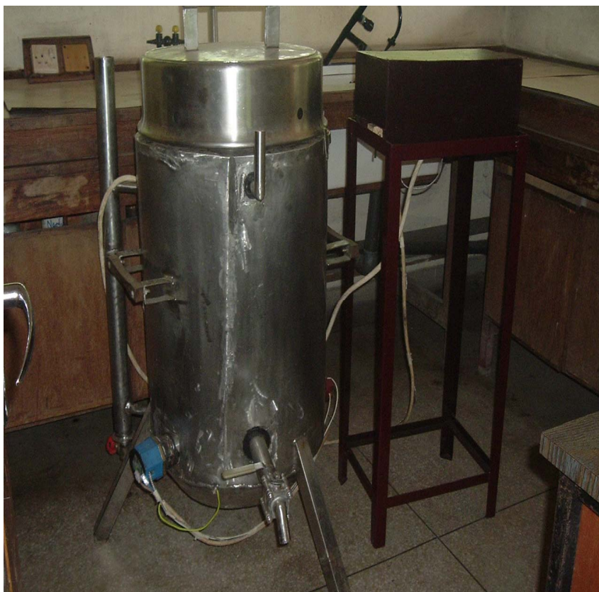
Figure 3: A hot water extraction jacket for preparing juice.

Key results area II: Promotion of production of value-added standardized herbal medicines of the currently used medicinal plants with therapeutic and nutritional potential..