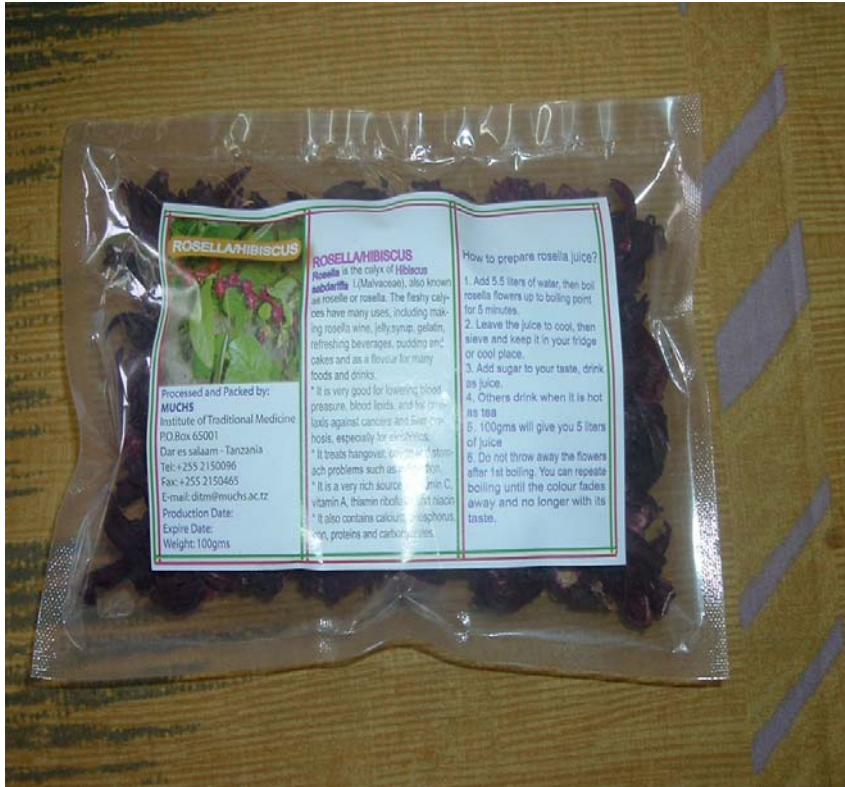
Figure 2: Packed Rosella calyces representing simple Packaging of nutritional supplements for direct use