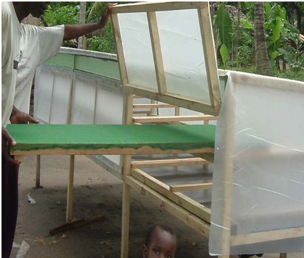
Figure 1: Demonstration solar dryer for drying herbal nutritional Supplements