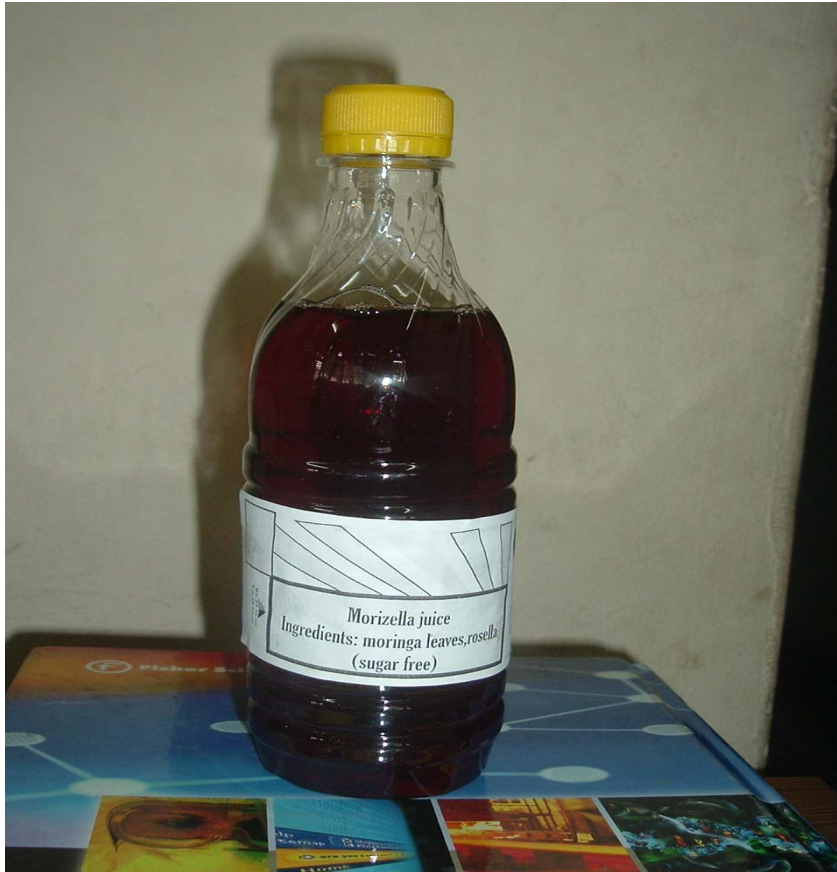
Figure 4: Morizella juice made from Rosella calyces and Moringa leaves for use as a nutritional supplement.