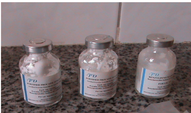
Figure 3 Two vials of fortified procaine penicillin and one of benzyl phenoxo penicillin bought from a part II medical shop (DLDB) without a prescription. Abbreviation: DLDB, duka la dawa baridi.

Poor knowledge on the basic pharmacology of antibiotics was substantiated by dispensing practices and misinformation provided by the dispensers. For instance, dispensers instructed the simulated client to apply PPF powder topically to treat fresh injuries. Some dispensers failed to distinguish cough expectorants from antibiotics and chlorpheniramine from cloxacillin; they also classified paracetamol as an antibiotic, and some were willing to dispense chloramphenicol and tetracycline to treat infections in neonates and headaches in adults. Tetracycline is contraindicated in neonates since