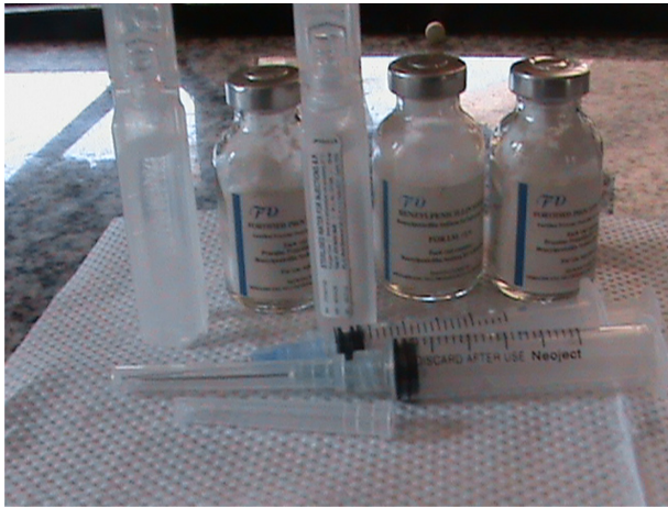
Figure 2 An illustration of benzyl phenoxo penicillin with syringes bought from one of the ADDO shops without a prescription.

Note: The seller was willing to inject our simulated client at the ADDO premises. Abbreviation: ADDO, accredited drug dispensing outlet.