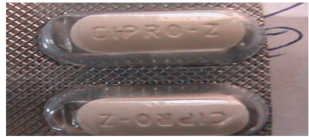
Figure 4 Ciprofloxacin tablets bought from an ADDO upon request, without a prescription.

Abbreviation: ADDO, accredited drug dispensing outlet.